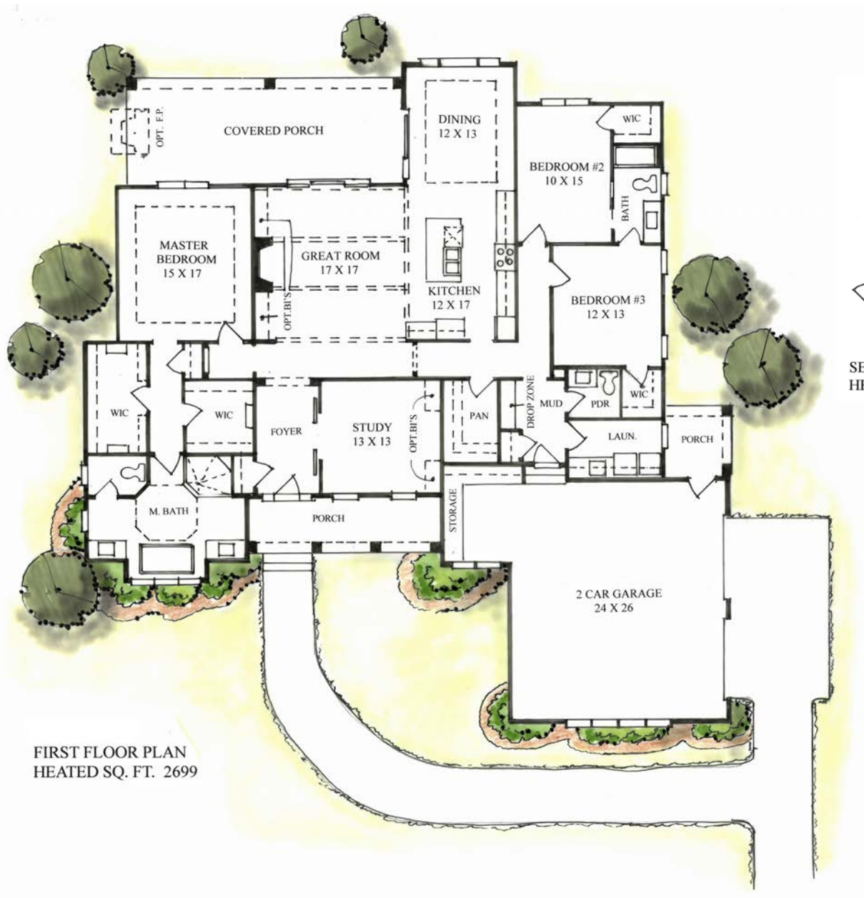
FIRST FLOOR PLAN HEATED SQ. FT. 2699